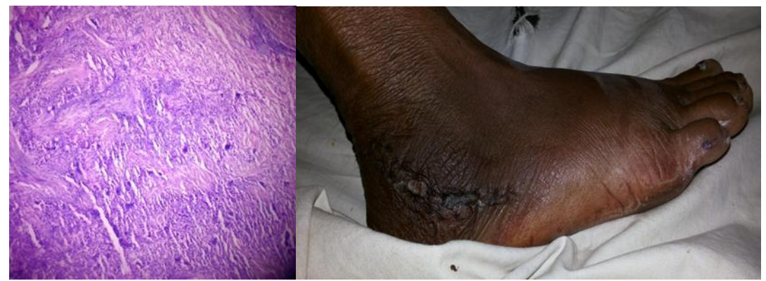
Figure 10: Histopathological slide