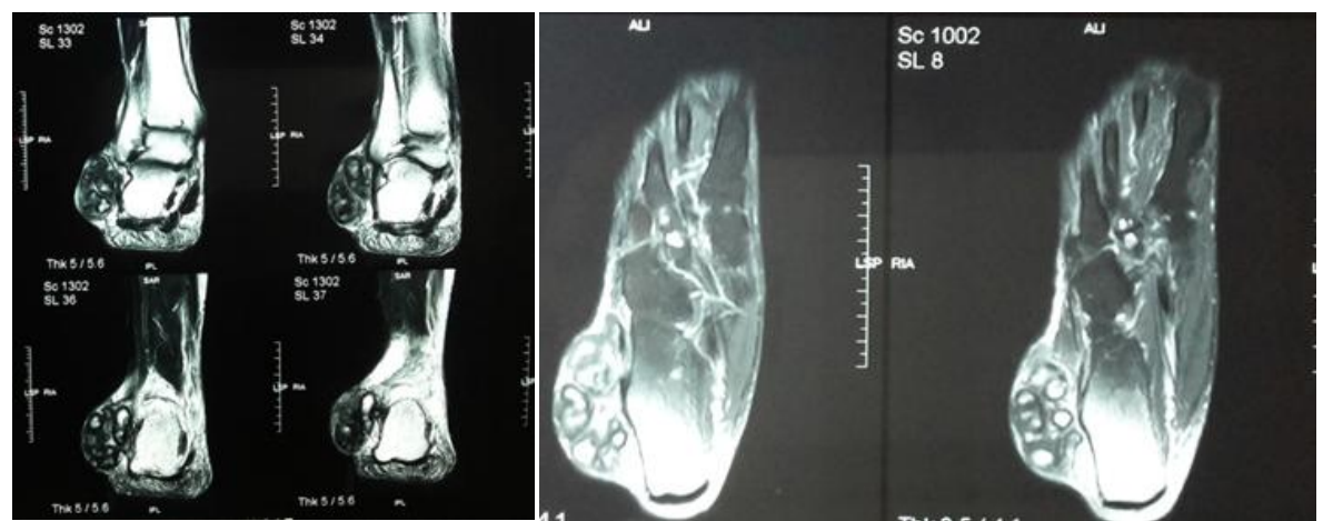
Figure 7: MRI pictures of swelling T1 and T2 images

X-ray showed a soft tissue lesion over the lateral aspect of the foot& ankle. MRI <sup>15</sup>showed a well-defined soft tissue lesion along the anterior aspect of peroneus tendon sheath. The lesion was iso-intense to muscles on T1, and mildly hyper intense on T2, suggestive of giant cell tumour of peroneal tendon sheath (figure7). The patient had a report of fine needle aspiration cytology (FNAC) <sup>9</sup> of the swelling. It showed a moderately cellular smear with mononuclear cells having round to oval nucleus & scant cytoplasm, foamy macrophages and plenty of lymphocytes and cholesterol clefts – findings suggestive of giant cell tumour of tendon sheath. The patient was posted for excisional biopsy.